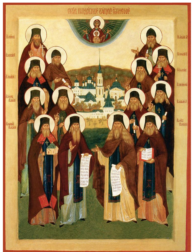
Ikona of the Synaxis of the Elders of Optina

http://www.stgabrielashland.org/synaxis-of-the-saints-of-optina/