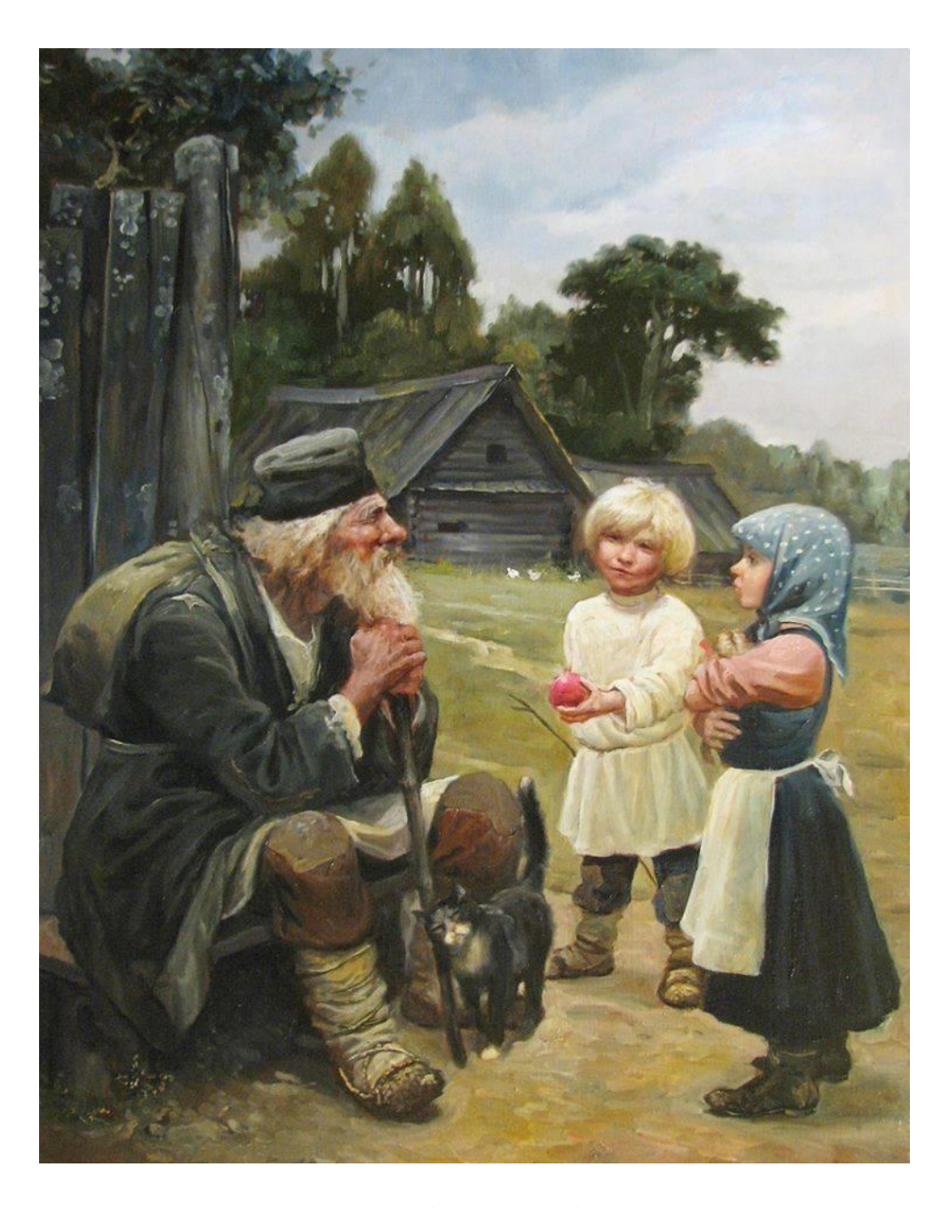
True wisdom is not to judge everyone, but to love everyone.