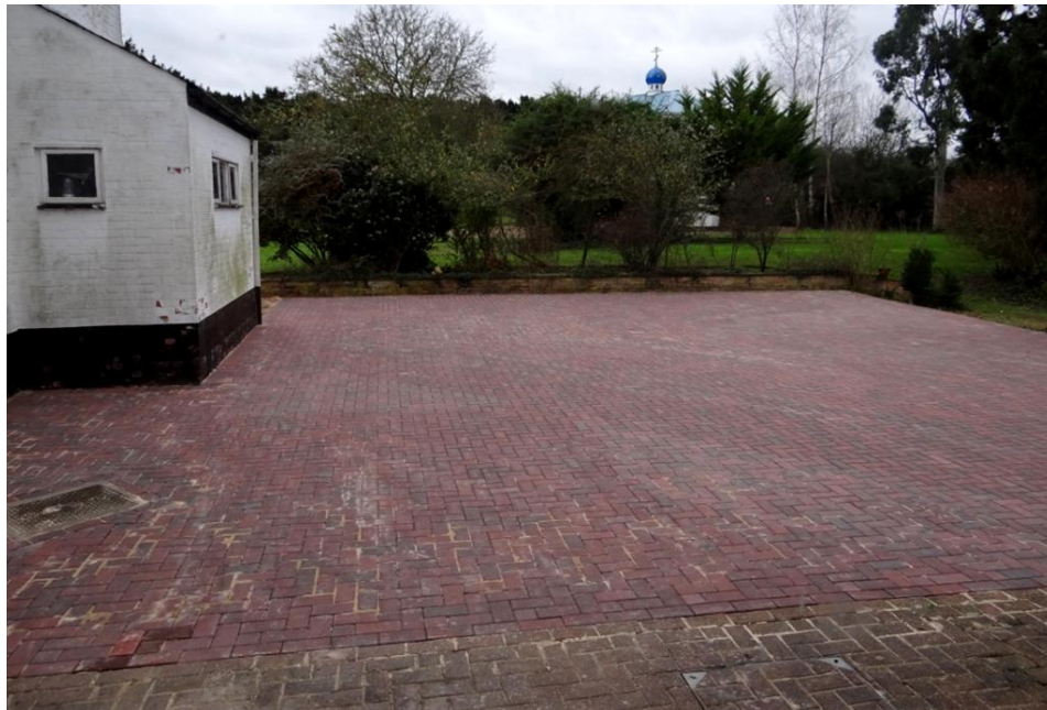
Collegiate Church of the Ikon of the Mother of God: Joy of All Who Sorrow The White House, Low Road, Mettingham, Suffolk, NR35 1TP Tel: (01986) 895176 www.mettingham.org.uk