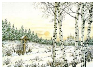
B) First Snow