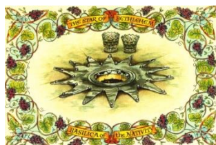
E) Star of Bethlehem