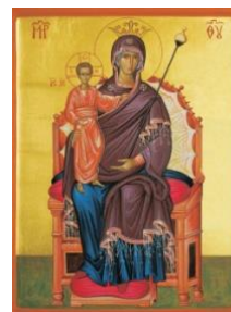
C) Our Lady of Mettingham