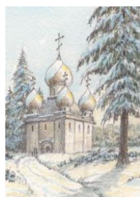
G) December Morning