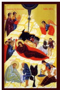
A) Ikon of the Nativity