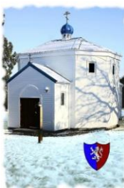
H) Church in the Snow