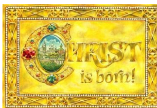
D) Christ is Born!