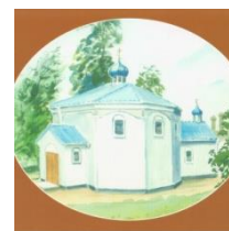
F) Watercolour of the Church