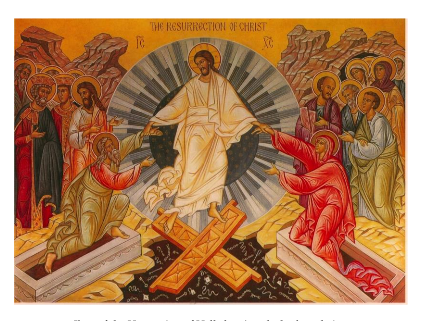
Ikon of the Harrowing of Hell showing the broken chains.