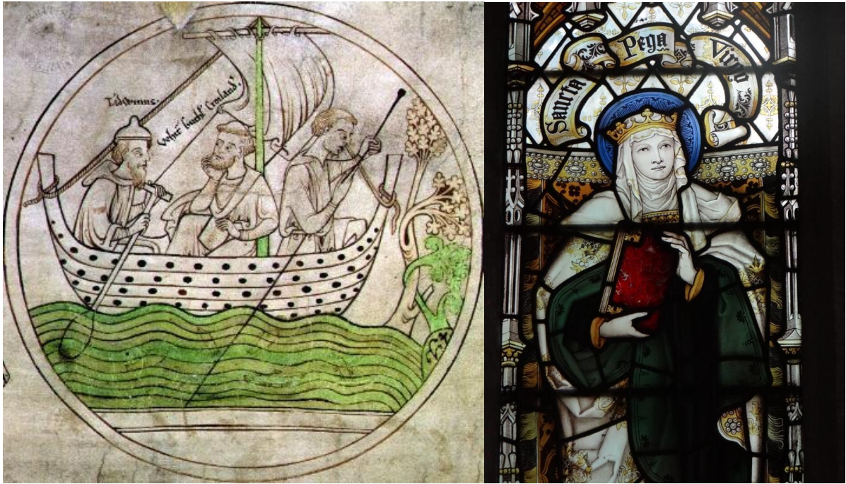
Scene from the Guthlac Roll and Stained Glass Window of St Pega at Peakirk. Below, skull of St Theodore.